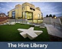
The Hive Library