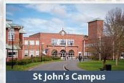
St John's Campus