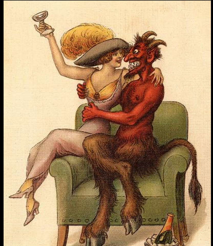
Some Vintage Postcards