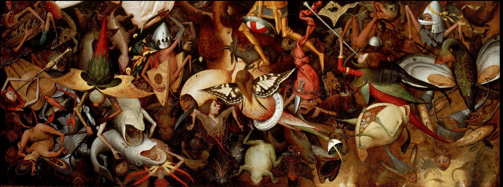
Peter Bruegel, The Fall of the Rebel Angels, 1562