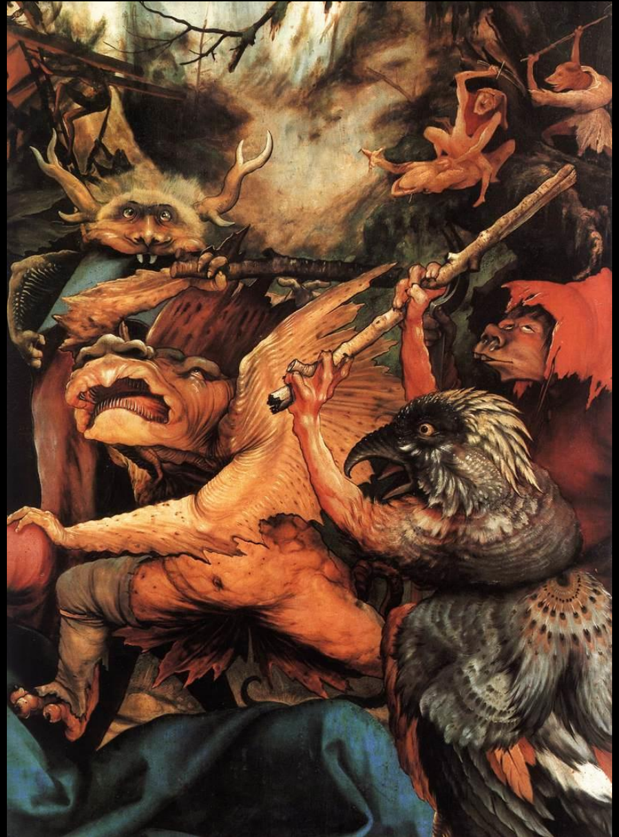
Matthias Grünewald, Temptation of St Anthony , c. 1515