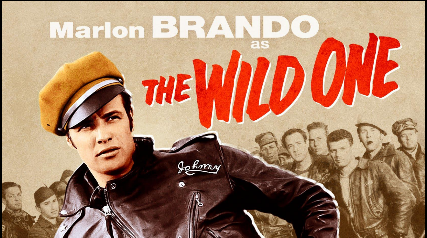
The Wild One (1953)

Why Do We Like the Devil? He Leads the Opposition