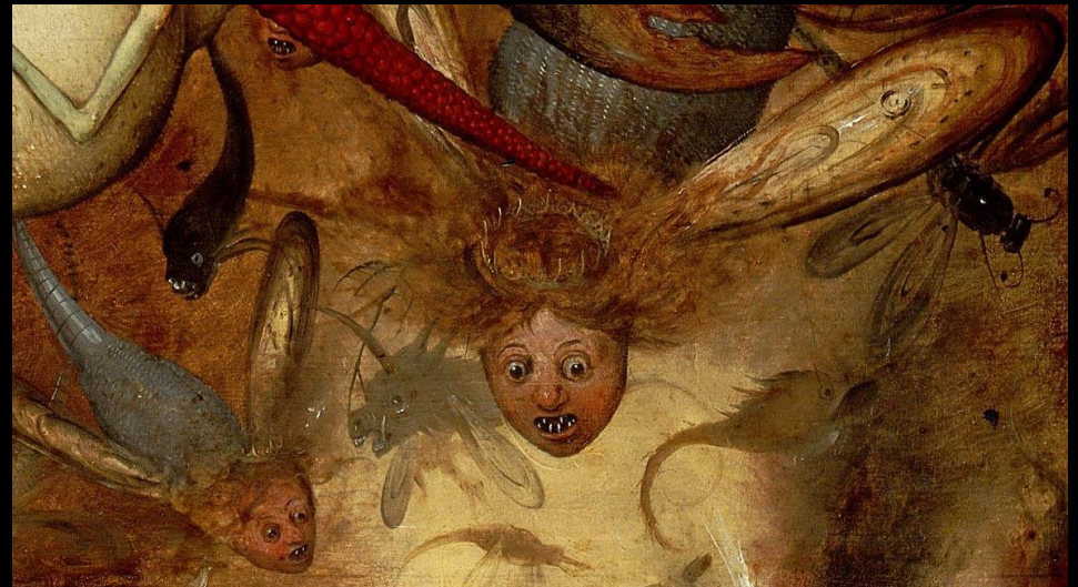
Peter Bruegel, The Fall of the Rebel Angels, 1562