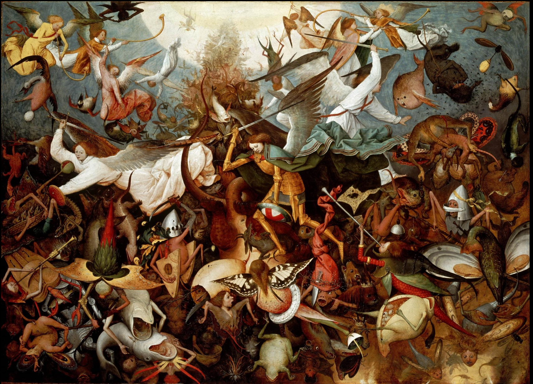
Peter Bruegel, The Fall of the Rebel Angels, 1562