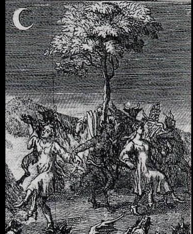
A French Sabbath, c. 1650