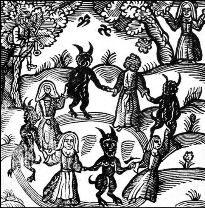
An English Sabbath, c. 1650