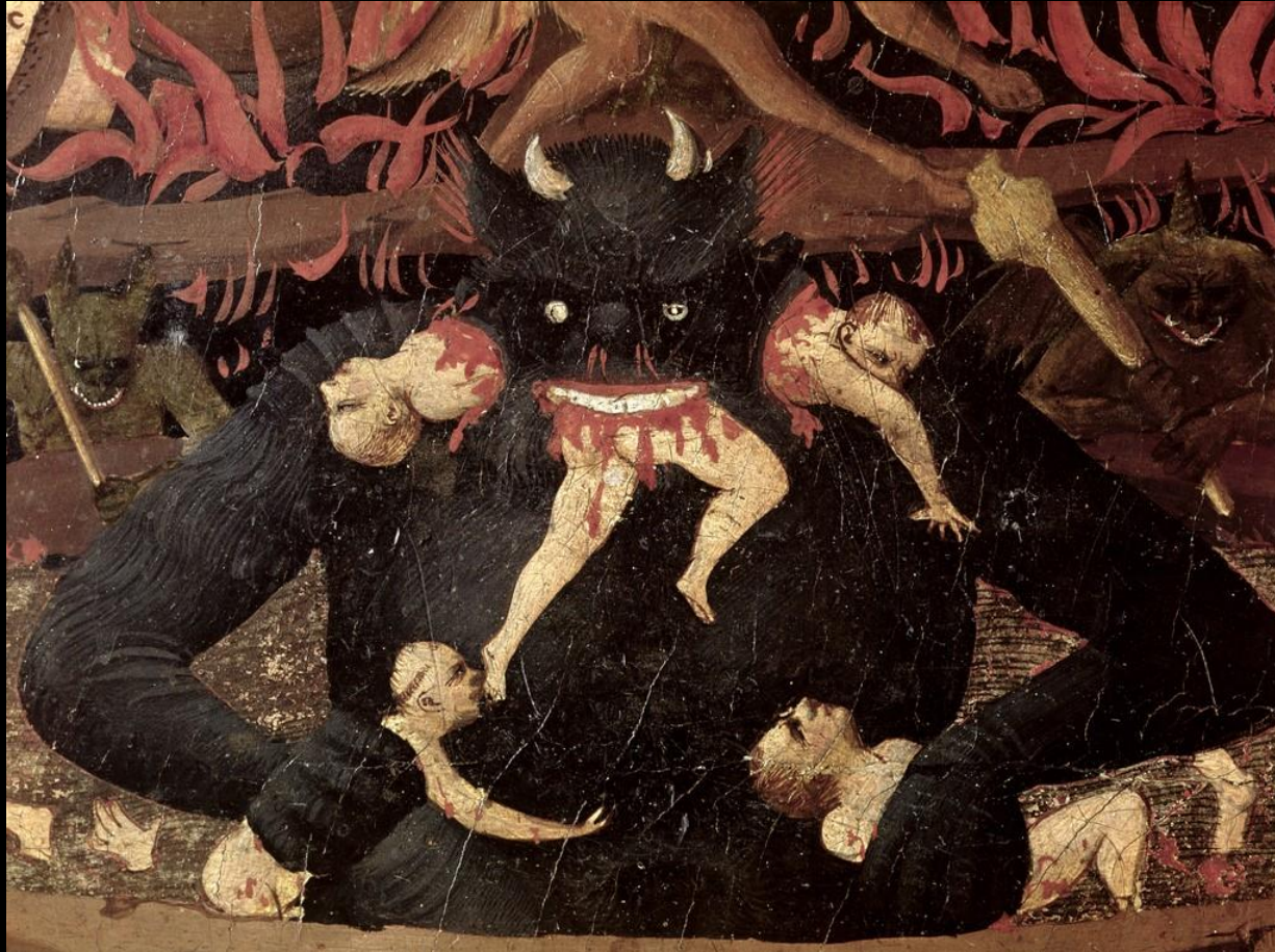
Detail from Fra Angelico's Last Judgement, San Marco, Florence, 1425-30