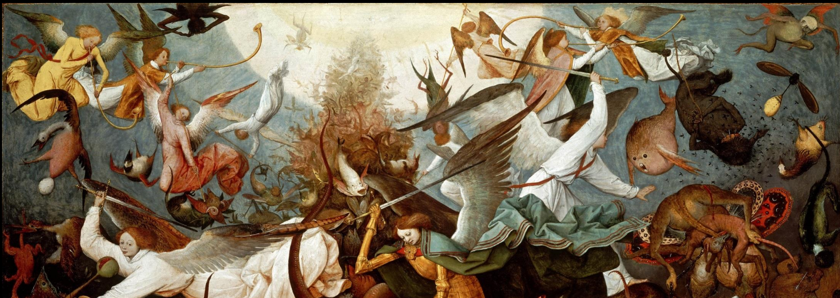
Peter Bruegel, The Fall of the Rebel Angels, 1562