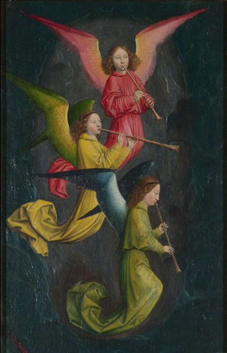
Simon Marmion, A Choir of Angels , c. 1458